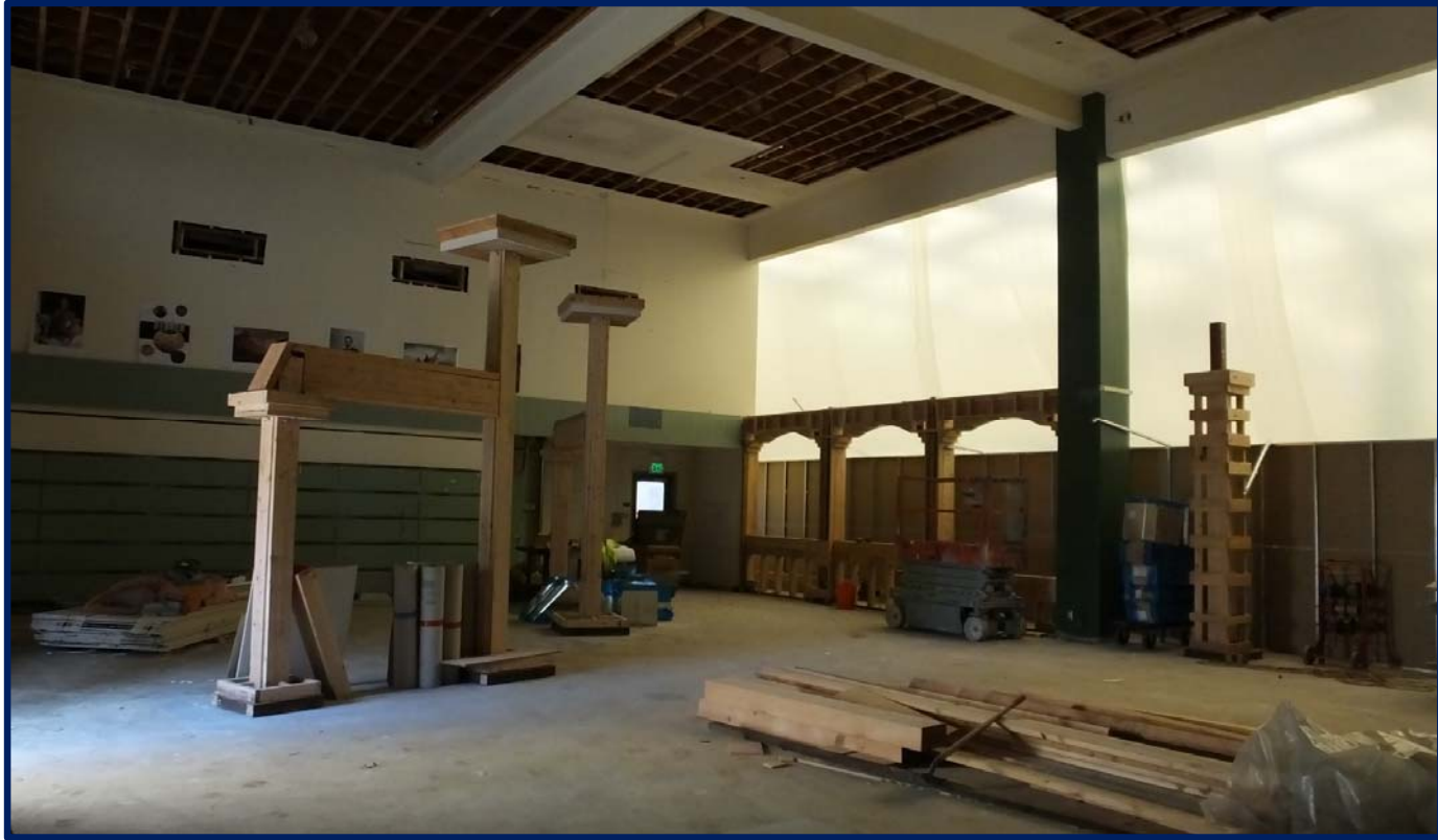
Morrill - FIS