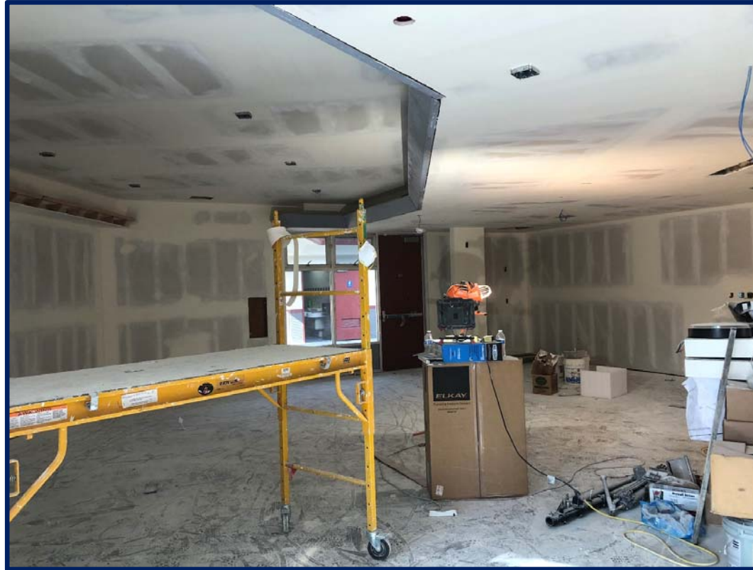
Ruskin - FIS