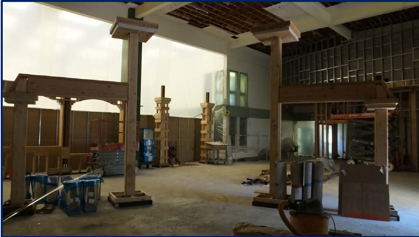
Morrill - FIS