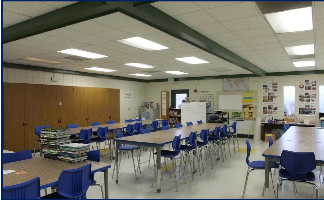
Morrill - Art Classroom