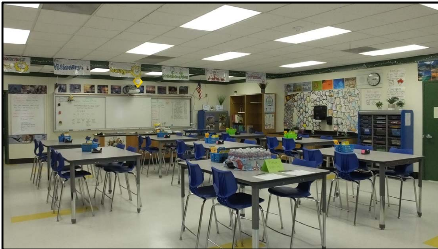
Morrill - Science Classroom