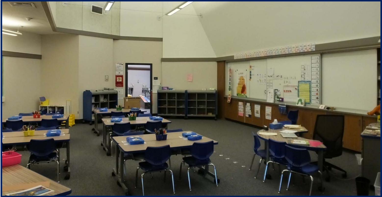
Cherrywood - Classroom