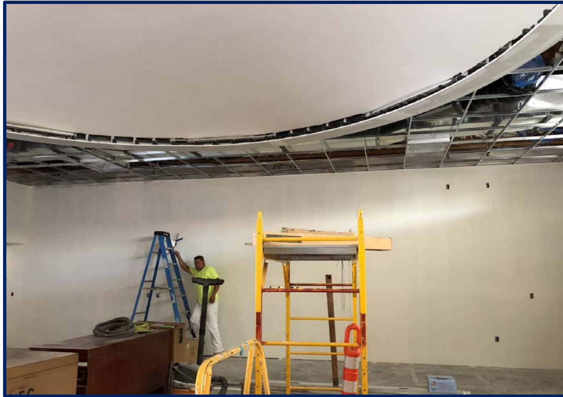
Piedmont - FIS