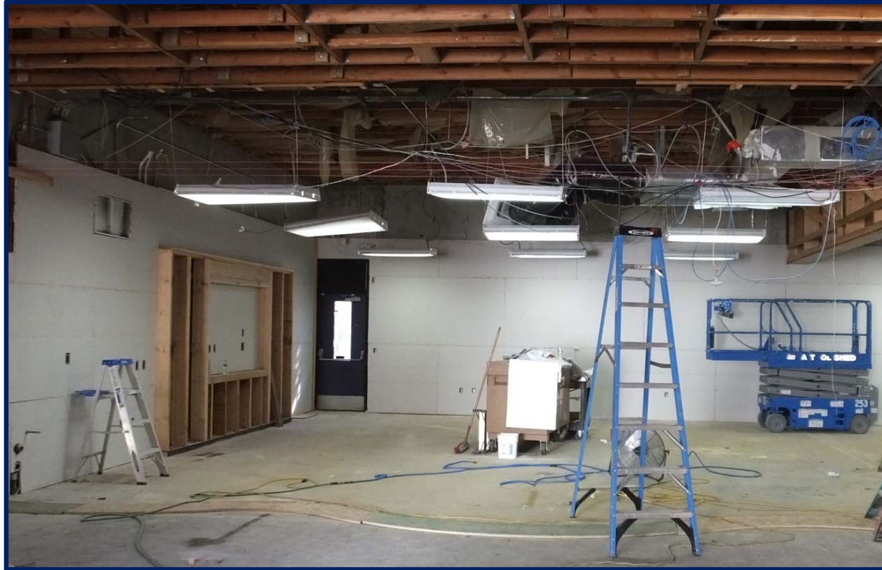
Brooktree – FIS