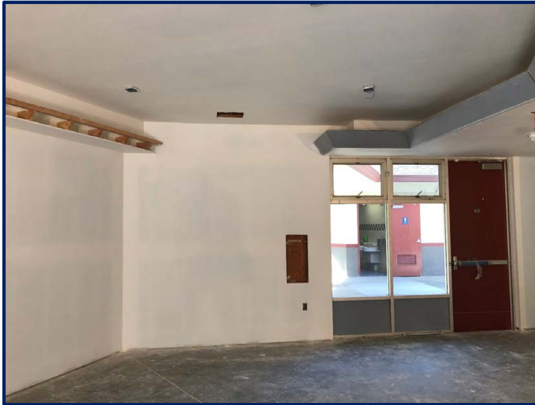
Ruskin - FIS