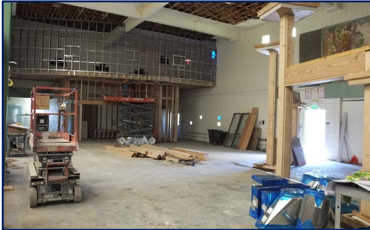
Morrill - FIS